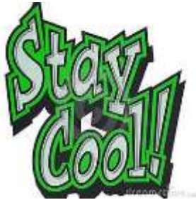
Just stay Calm