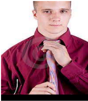
Image and Hygiene